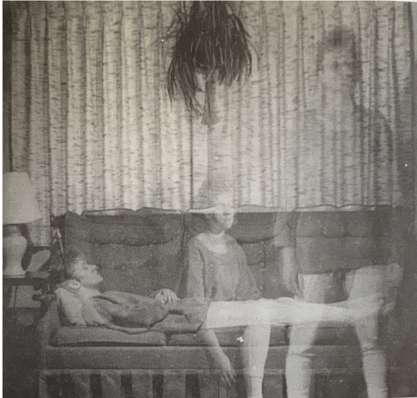
Scott Douglas Honorable mention Black and white photography