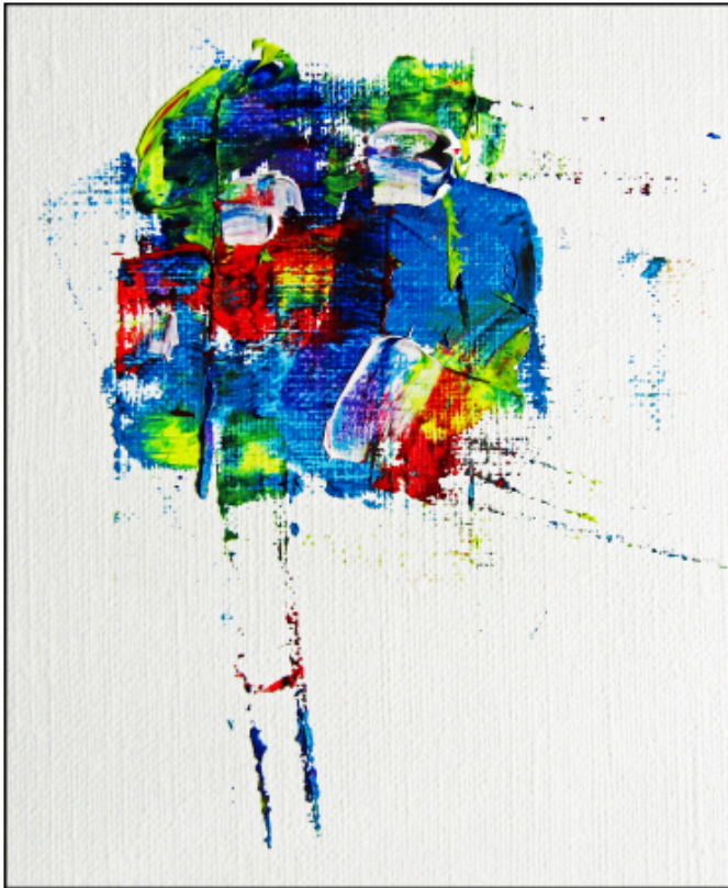
Oil on Paper