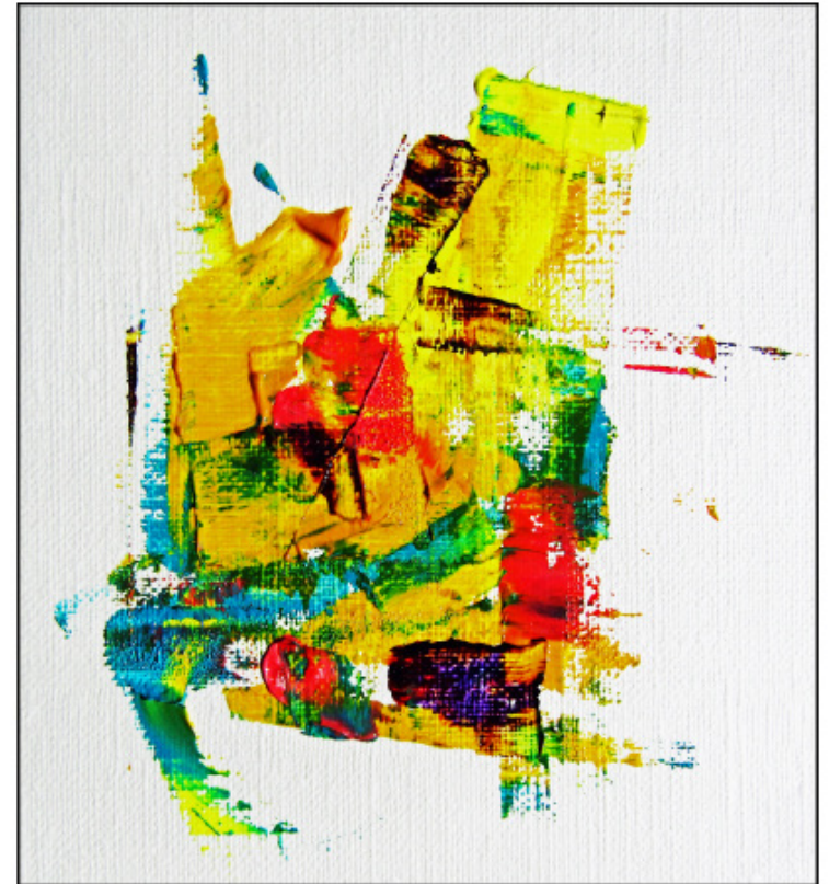
Oil on Paper