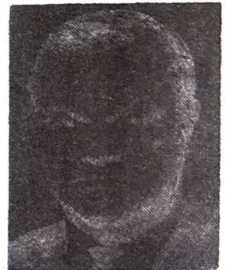
Coates of Hell